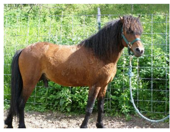
Gentleman Jim son of Kopper Kid