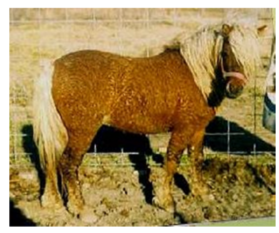
Kopper Kid (McKay)