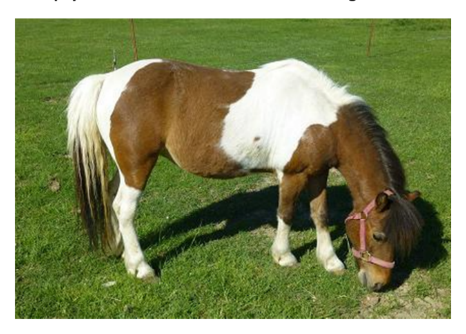
Baby pics of Gipsy and her foal coat-