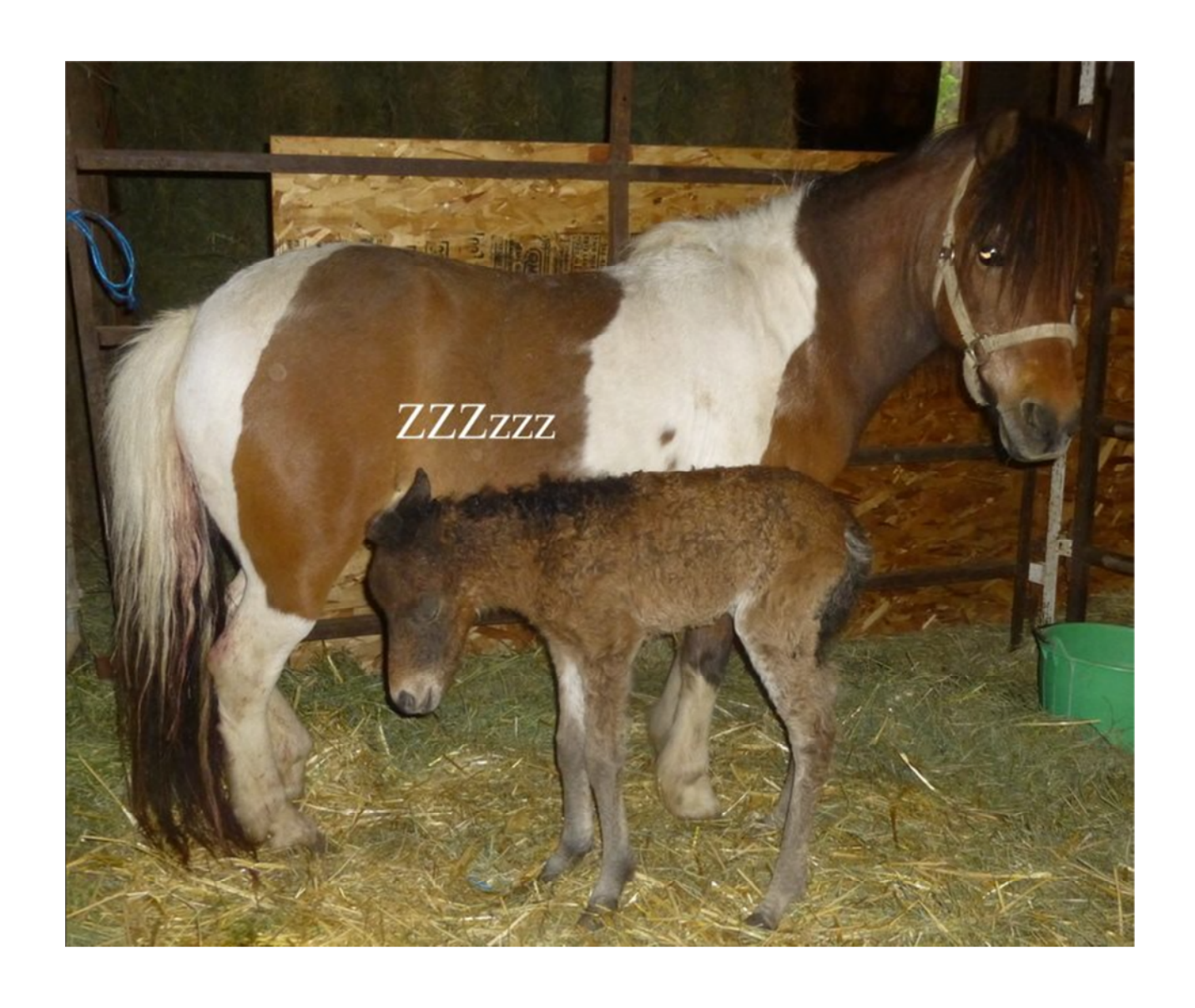
Gipsy, if bred, should be breed to a straight Miniature to keep this unknown gene separate from other Curly coat genes. She is currently for sale.