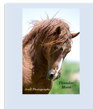
The OFFICIAL STANDARD for The NORTH AMERICAN CURLY HORSE