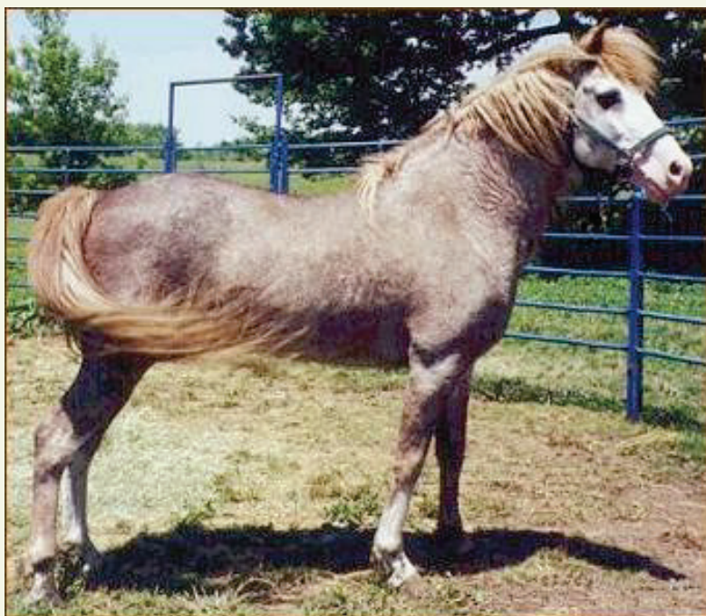
Sir Patrick MJT, Curly gaited stallion also registered MFTHBA.

Walker's Prince T was a popular gaited Curly Stallion and was often used to breed with Missouri Fox-trotter mares which continues today. Many Gaited Curlies are also registered as MFTHBA horses as well as Curly registered.