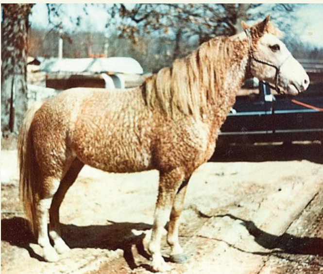
Walker's Prince T widely used stallion.

Curly Jim was bred to mare called the Bradford Mare and the offspring, a mare named Blaze, who later produced the well known gaited Curly stallion Walker's Prince T.