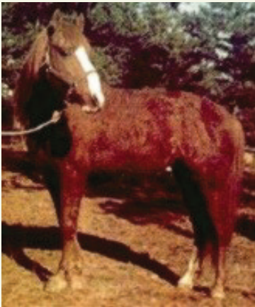
Curly Jim- Unknown sorrel stallion.