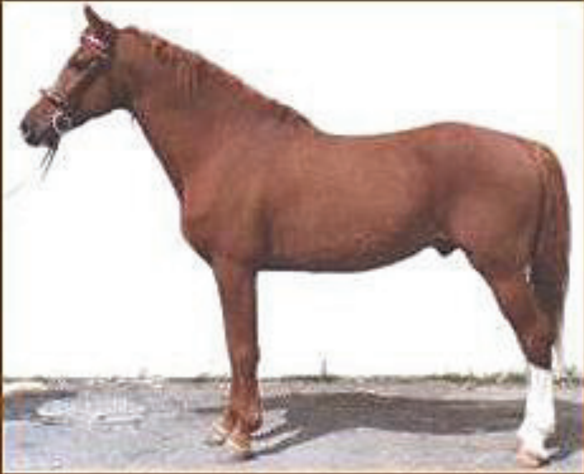
Charming Prince- a well known Curly Jim line stallion.

Below are two definitions from Wikipedia on the foxtrot and the ambling gait known as the "fox trot"....."a four-beat broken diagonal gait in which the front foot of the diagonal pair lands before the hind, eliminating the moment of suspension and increasing smoothness. Ambling is any of several four-beat intermediate horse gaits , all of which are faster than a walk but usually slower than a canter and always slower than a gallop . They are smoother for a rider than either the two-beat Trot or pace and most can be sustained for relatively long periods of time, making them particularly desirable for trail riding and other tasks where a rider must spend long periods of time in the saddle."