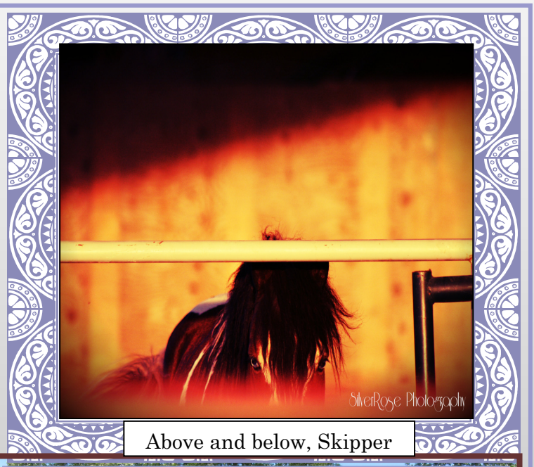
Above and below, Skipper