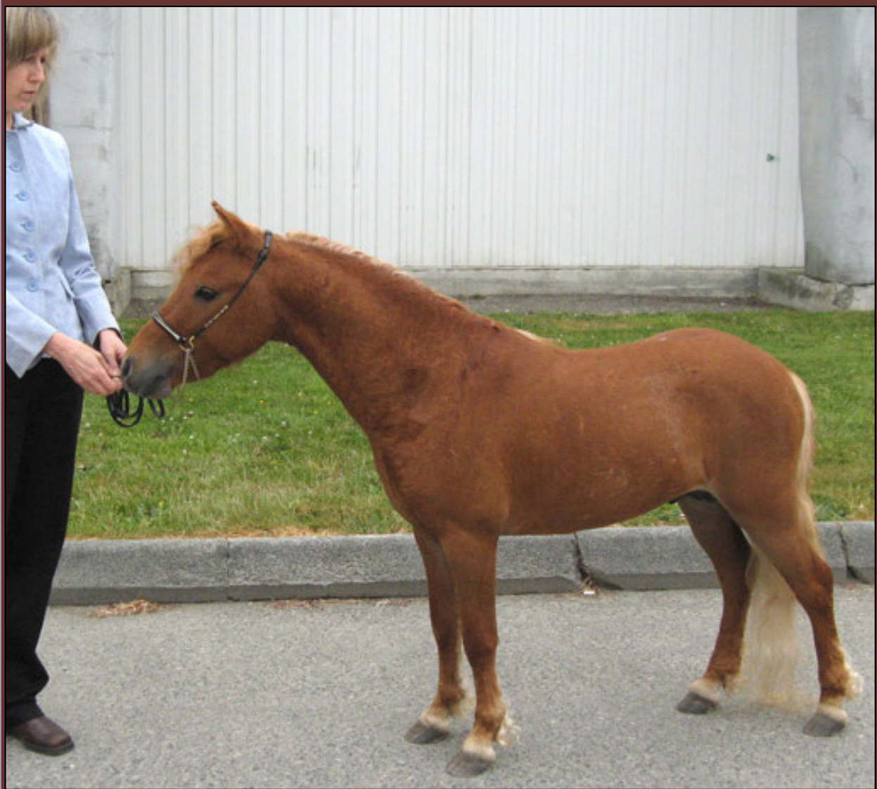
Above, Twisted Expression-EB , 2006 Stallion, and Right, Sugar and Pepper , Mini Curly ponies, Ellen Bancroft Miniature Curlies.