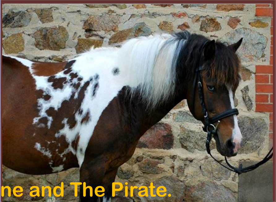
Fortune and The Pirate.