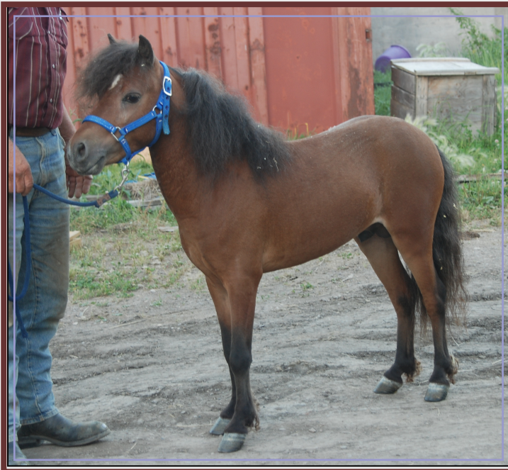
Fireside's Sir Prize , left