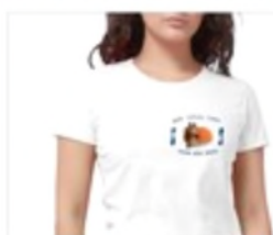
ICHO Virtual Horse Show