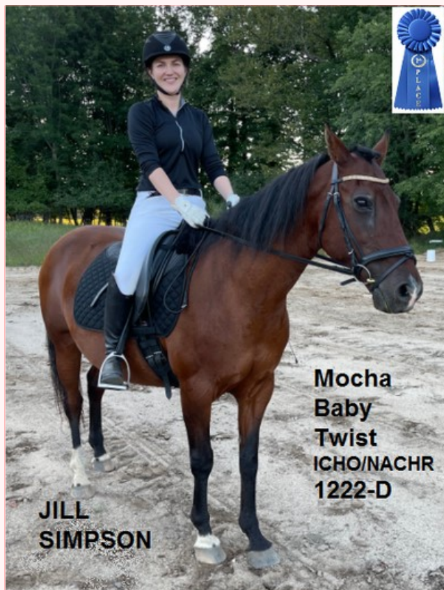
Mocha Baby Twist ICHO/NACHR 1222-D