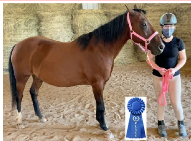
Lane Douglas Mocha Baby Twist 1222-D

FIRST PLACE- Adult ICHO Intro Test A #110 FIRST PLACE- Adult ICHO Intro Test C #118